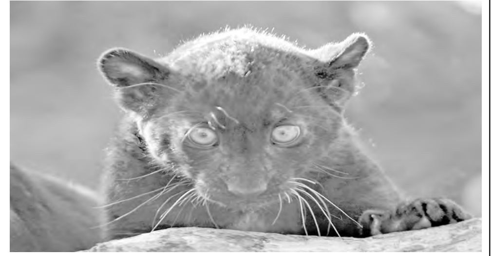
The new baby panther cub emerges from the gym to play on Rudolph Field.

Send in your name suggestions for the cub through Prep's official Instagram: @ seapreppanthers